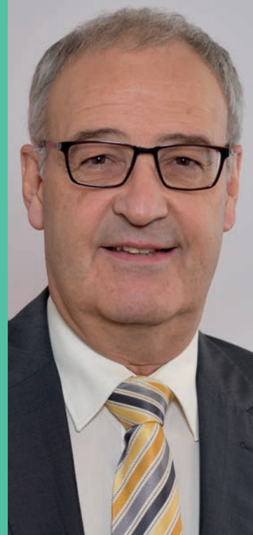
Guy Parmelin, Federal Councillor

“The life sciences cluster of the Basel Area is not only hugely important for Switzerland’s economy, but also occupies a leading position both in Europe and globally.”